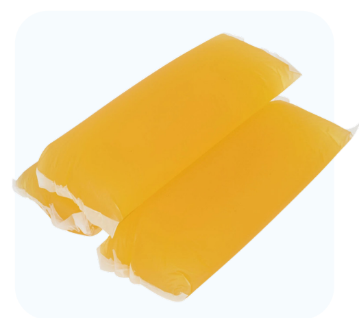
1 kg per pc