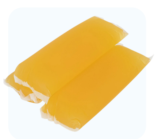
1 kg per pc